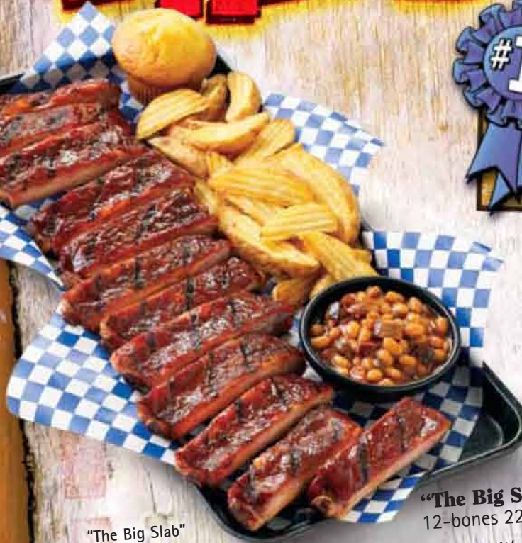
"The Big Slab"

Hand-rubbed with Dave's secret blend of tongue-tingling special spices and pit-smoked for 3-4 hours over a smoldering hickory fire. Then slathered with sauce over an open flame to seal in the Famous flavor and give them a crispy, caramelized coating. Like yours un-sauced? Order 'em naked.