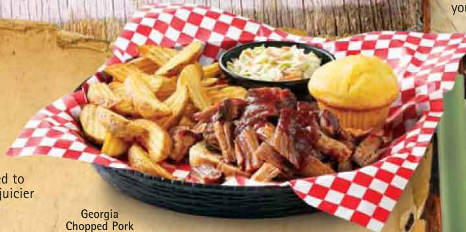
Georgia Chopped Pork

Served with a corn bread muffin and your choice of two sides.