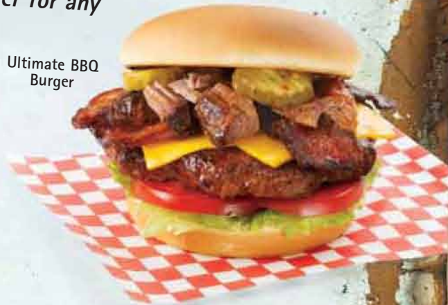
Ultimate BBQ Burger

A meaty burger that's really lean? Now you're talkin' turkey! Premium ground turkey on a toasted bun loaded with lettuce, tomato, red onion and our special BBQ mayo. 8.29