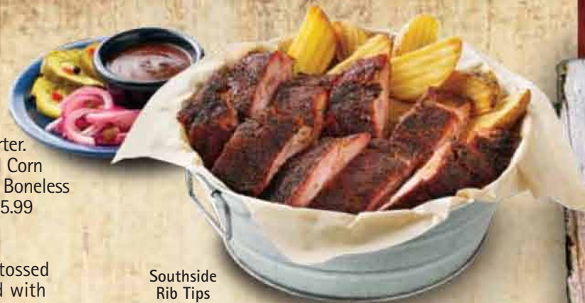
Southside Rib Tips

Our own hickory-smoked salmon, cream cheese, capers and chipotle peppers makes this a spread worth swimming upstream for. Served with fire-grilled flatbread. 6.99