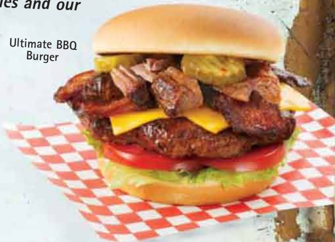
Ultimate BBQ Burger

*Consuming raw or undercooked meats may increase your risk of food borne illness.