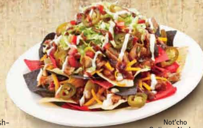
Not'cho Ordinary Nachos: Grande

*These sides are a tasty 100 calories or less.