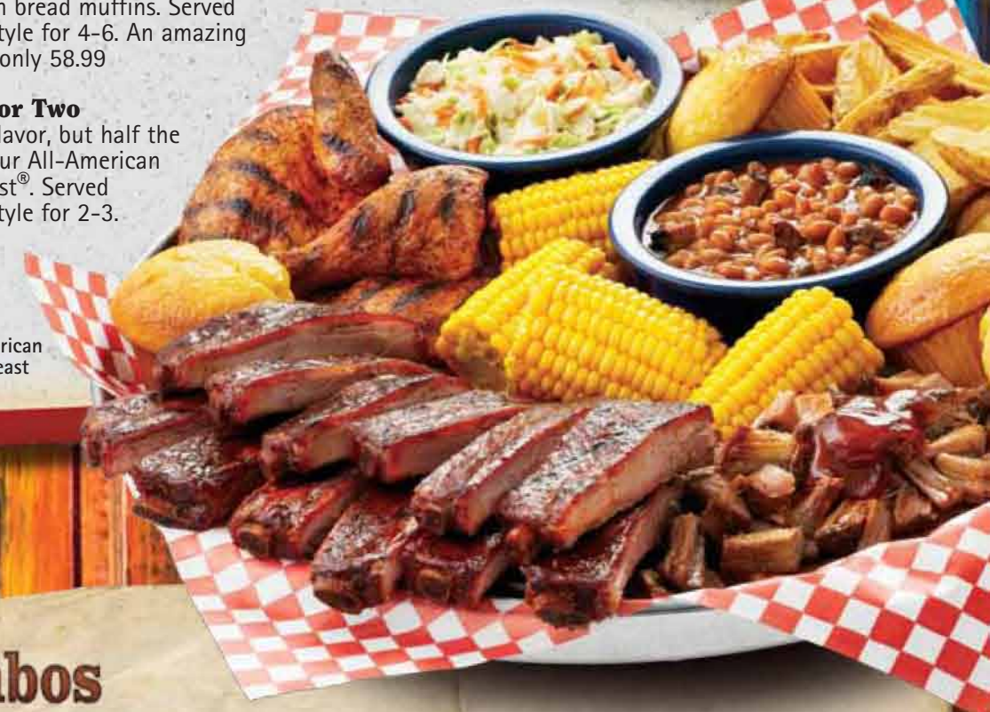
All-American BBQ Feast

All the flavor, but half the size of our All-American BBQ Feast®. Served family-style for 2-3. 31.99