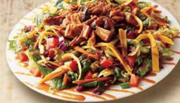
Dave's Sassy BBQ Salad

A tribute to Southern tradition, banana pudding straight from Grandma's kitchen! Rich and creamy with slices of fresh bananas and vanilla wafers. 3.99