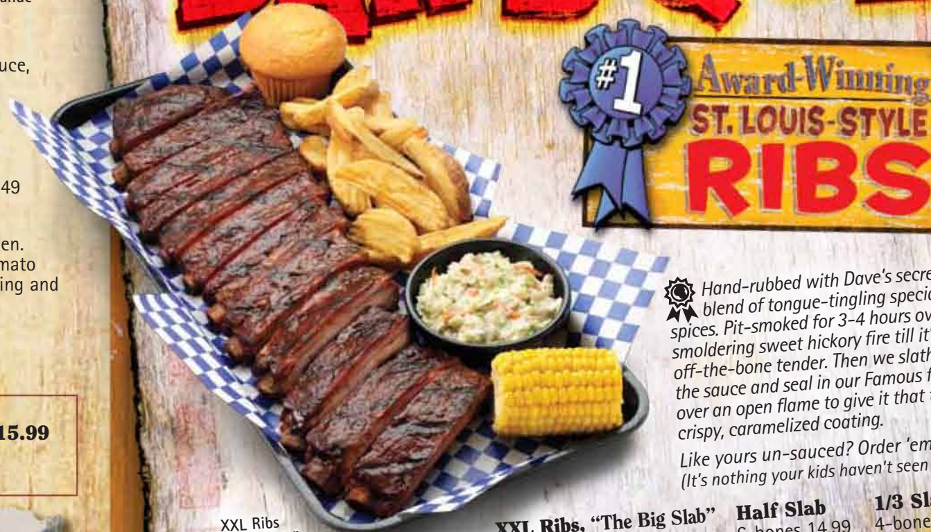
XXL Ribs "The Big Slab"