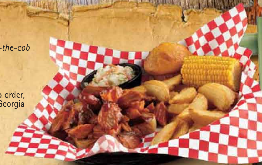
Georgia Chopped Pork

Tender, all-white meat tenders fried to crispy perfection. Served with Sweet Soul Jalapeño sauce. 11.99