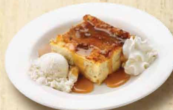
Dave's Famous Bread Pudding